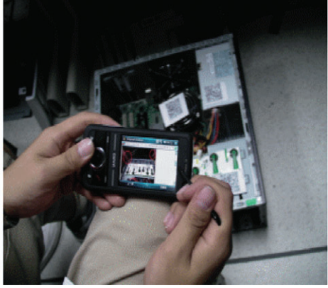
Figure 2: Learning scenarios of the PC-DIY (Personal Computer- Do It by Yourself) ubiquitous learning activity